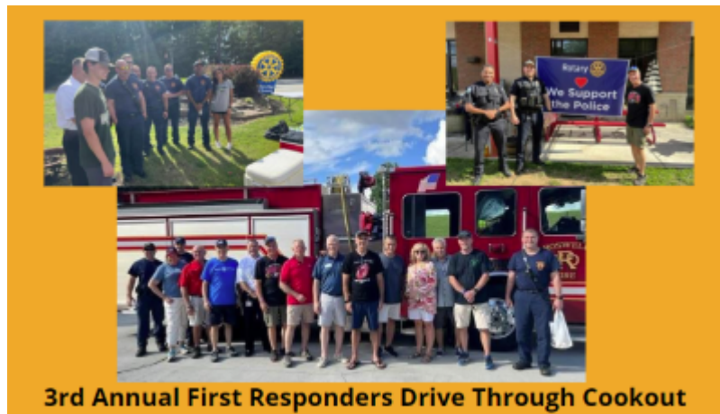
3rd Annual First Responders Drive Through Cookout

This week we remember the 2,977 people who lost their lives on September 11, 2001 in the single largest foreign attack on American soil. We honor the memory of 441 first responders - fire, police and EMS - who died that day trying to rescue those trapped in buildings that had been hit, the greatest loss of emergency responders on a single day in American history.