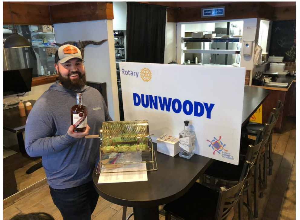
At this time, we're about halfway to goal for both Whiskey Raffles #2 and #3: 70 tickets sold for each and 80 more opportunities to win available. And all an opportunity to raise money that supports the good work we do in the community and around the world.

Our second drawing will take place November 17 - and features a bottle of Weller 12year-old bourbon whiskey valued at $350. Help meet our goal to sell 150 tickets at $20 each by talking this up to friends and family. You can buy your tickets now at our <u>Whiskey Raffle website</u>; [more]