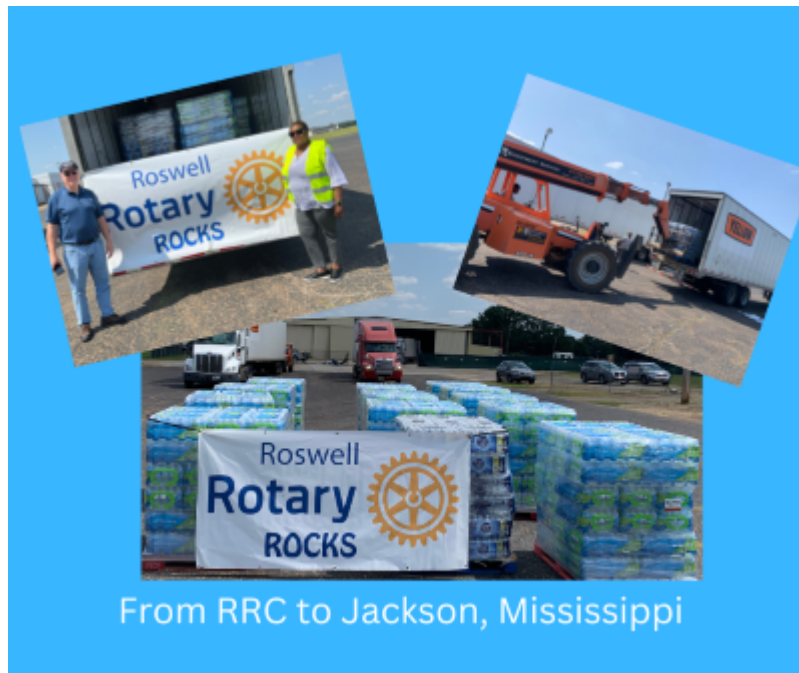
From RRC to Jackson, Mississippi

You are thirsty. You go to your sink and turn on the faucet. Clean, drinkable water comes out. But it's not always a guarantee. Ask the people of Jackson, Mississippi.