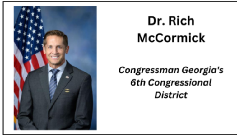
Dr. Rich McCormick

Congressman Georgia's 6th Congressional District