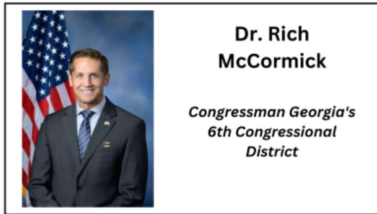
Dr. Rich McCormick

Congressman Georgia's 6th Congressional District