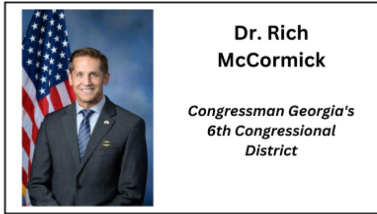
Dr. Rich McCormick

Congressman Georgia's 6th Congressional District