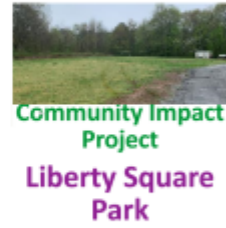
Community Impact Project Liberty Square Park