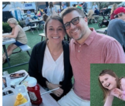
Over the Hump Day