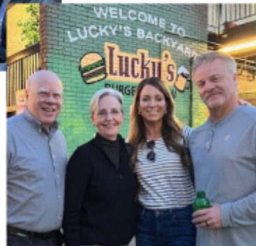
Over the Hump Day