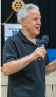
Mr. Committee Chair