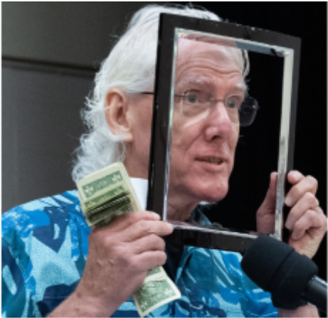
Roswell Rotary Squares Fun