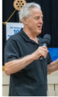
Mr. Committee Chair