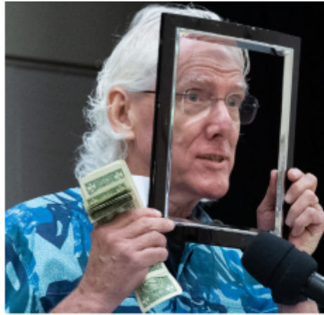
Roswell Rotary Squares Fun