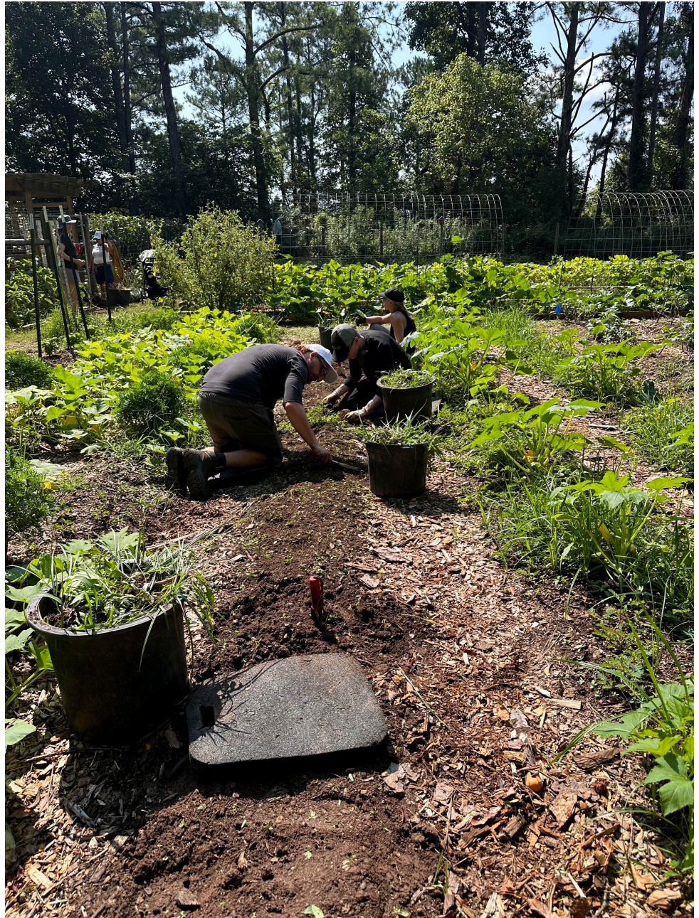
Last Week at Roswell Rotary