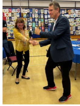
Dancing in the Gym