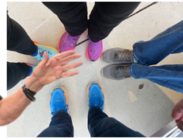
The Service Project Magician