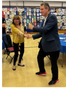
Dancing in the Gym