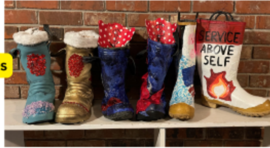
Boots for Heroes

Welcome Welcome Welcome to all who come to the Roswell Rotary meeting this Thursday for lunch. We will not only be hosting 13 of our 16 Interact Clubs but also the City of Roswell Youth Ambassadors for the Youth Day Parade on Saturday, Oct 3rd. This meeting is always inspiring and gives us the very face of hope on our stage.