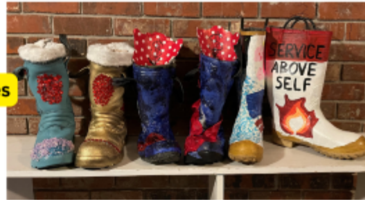
Boots for Heroes

Welcome Welcome Welcome to all who come to the Roswell Rotary meeting this Thursday for lunch. We will not only be hosting 13 of our 16 Interact Clubs but also the City of Roswell Youth Ambassadors for the Youth Day Parade on Saturday, Oct 3rd. This meeting is always inspiring and gives us the very face of hope on our stage.