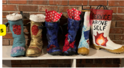
Boots for Heroes

Welcome Welcome Welcome to all who come to the Roswell Rotary meeting this Thursday for lunch. We will not only be hosting 13 of our 16 Interact Clubs but also the City of Roswell Youth Ambassadors for the Youth Day Parade on Saturday, Oct 3rd. This meeting is always inspiring and gives us the very face of hope on our stage.