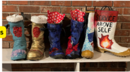
Boots for Heroes

Welcome Welcome Welcome to all who come to the Roswell Rotary meeting this Thursday for lunch. We will not only be hosting 13 of our 16 Interact Clubs but also the City of Roswell Youth Ambassadors for the Youth Day Parade on Saturday, Oct 3rd. This meeting is always inspiring and gives us the very face of hope on our stage.