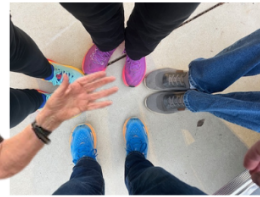
The Service Project Magician