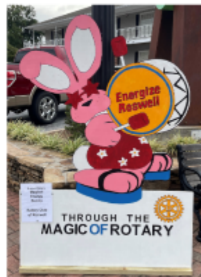
After Hours Club Roswell Rotary Club