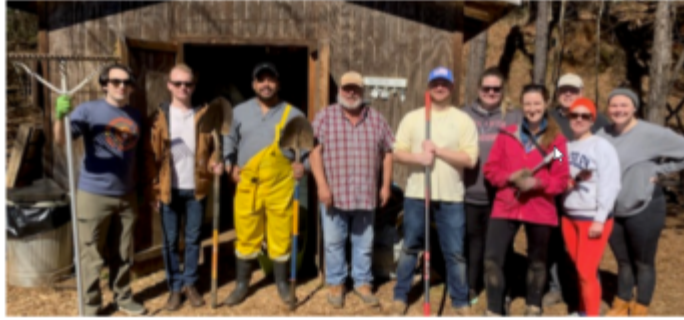
The Roswell Rotary After Hours Club working on the Unity Garden at the Chattahoochee Nature Center.

Roswell Rotary supports environmental sustainability through its After Hours Club, which repurposes plastic grocery bags to aid produce transport from the Chattahoochee Nature Center's Unity Garden to the North Fulton Community Charities local food pantry. The group also actively participates in Georgia's annual "Sweep the Hooch" river cleanup and other city park beautification projects.