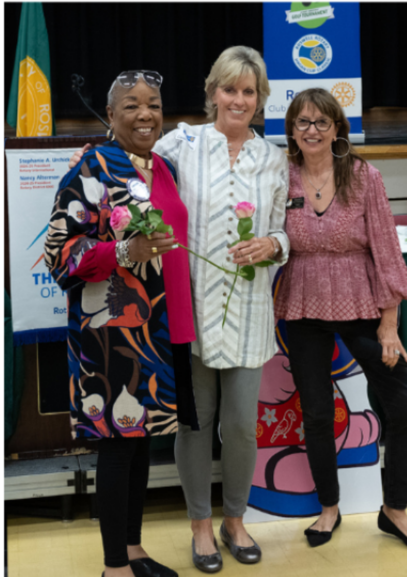
Cancer Will NOT Win!