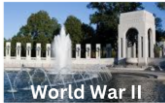
World War II