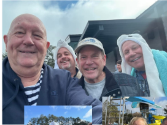
Polar Plunge Pix