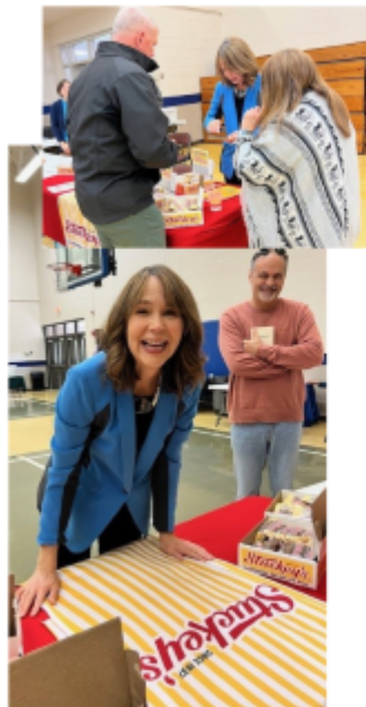
Stuckey's Branding Rocks!!