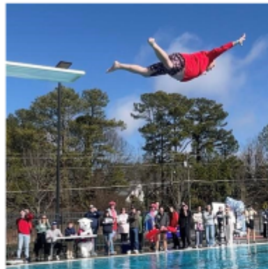
District Governor Belly Flop King at Polar Plunge