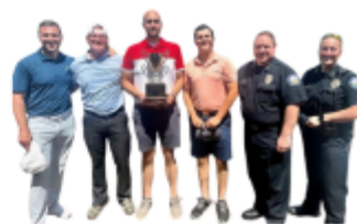
Fire Dept vs Police Dept 2025 Winners RPD