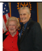
Barbara M. and Donald L. Thomas Peace Award