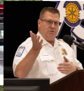
Roswell Fire Dept. Demo EV Fire Tools