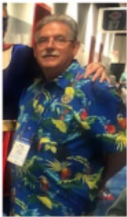
Blue Parrot Shirt