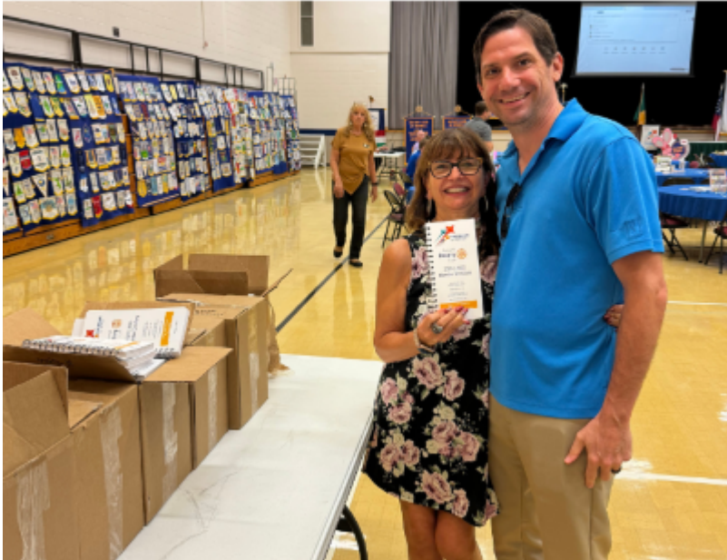
Behind the Scenes Magic