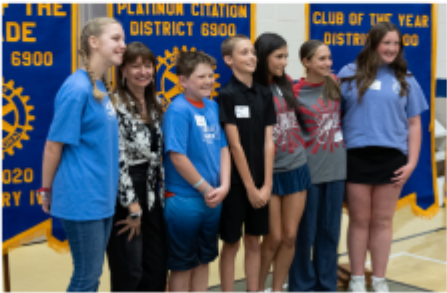
Crabapple Middle School