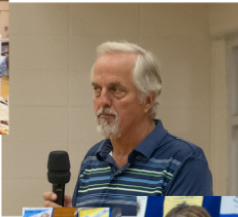
New, Old & Familiar Faces