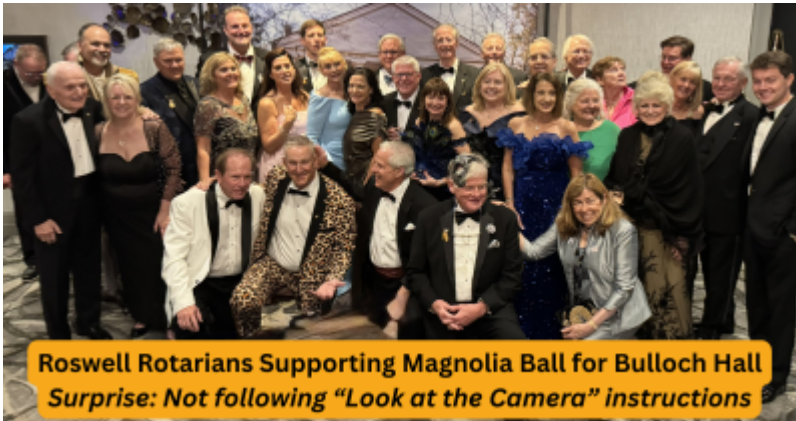
Roswell Rotarians Supporting Magnolia Ball for Bulloch Hall Surprise: Not following "Look at the Camera" instructions

Be there! Special Memorial Day Program meeting Thursday, May 21