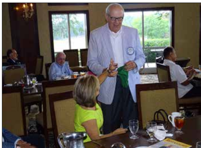
DAWN YOU WANT THE RED BALL. SHUCKS!